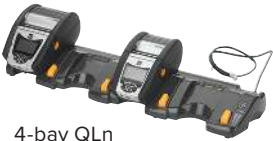
4-bay QLn Ethernet Cradle

Connect QLn printers to your wired Ethernet network via the QLn Ethernet cradle to enable easy remote management by your IT or operations staff — helping to ensure each printer is operating optimally and ready for use. The Ethernet cradle can communicate over 10 mbps or 100 mbps networks using auto-sense.