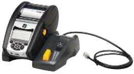
Single-bay QLn Ethernet Cradle